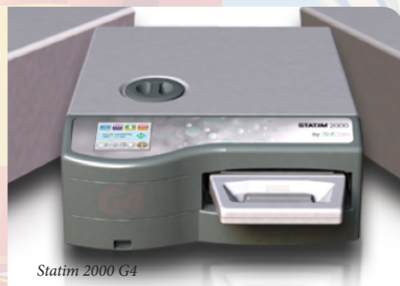
Statim 2000 G4