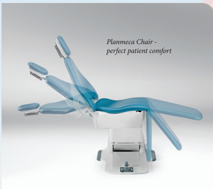
Planmeca Chair - perfect patient comfort