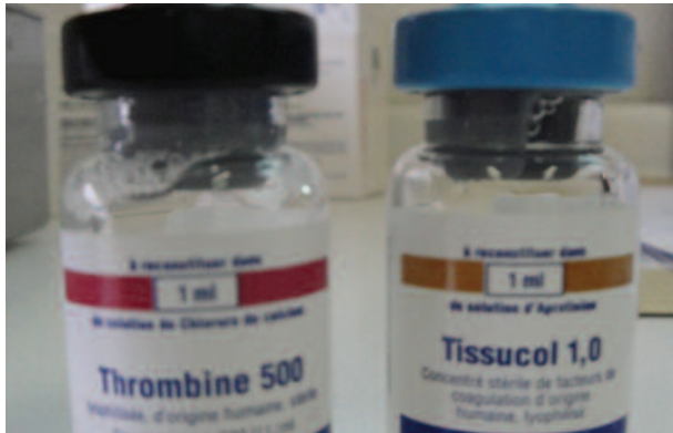
Figure 7: Solutions formed from Calcium chloride (tube1), and Aprotinine (tube2).