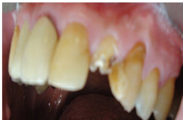
Figure 1: Clinical presentation of the fractured 22 tooth.

A loco-regional peri-apical without epinephrine analgesia