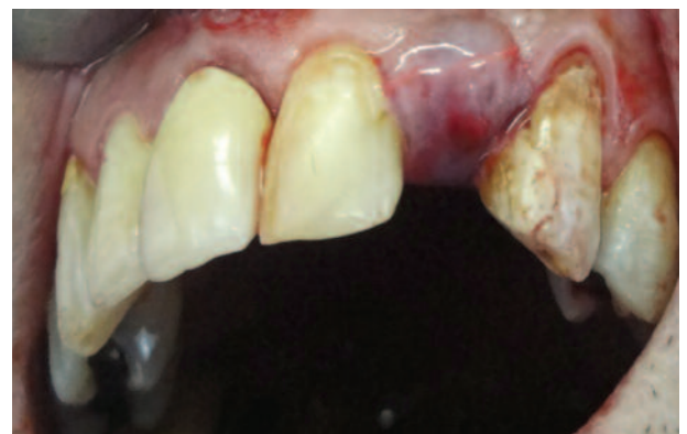
Figure 10: Behavior of biological glue in isolating and stabilizing the surgical wound.