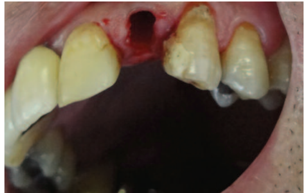
Figure 4: Intraoral presentation of the extraction socket, note the low bleeding rate in this area.