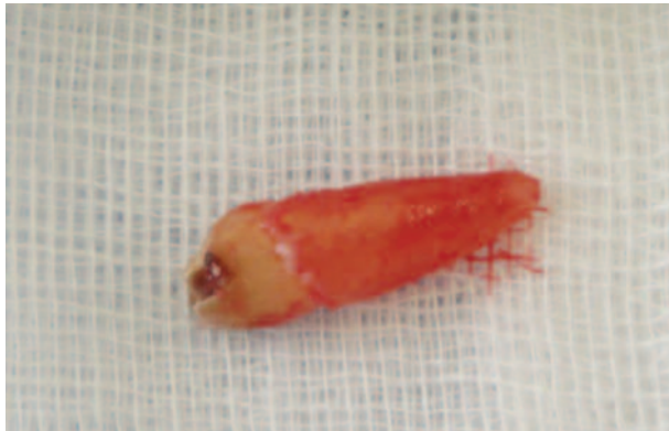
Figure 3: After conservative surgical procedure, the 22 tooth was removed.