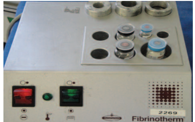
Figure 8: The Fibrotherm will guide the 4 tubes to the ambient temperature (37°C) by using a thermostated agitator.

is much more frequent in females. This could be due to the fact that women are more frequently treated with bisphosphonates in cases of post menopausal osteoporosis.