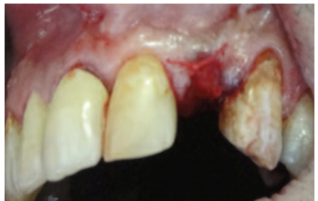
Figure 6: 4(0) absorbable vicryl rapide (polyglactin 910) sutures were added to the hemostatic sponge to adapt it in place and lower the soft tissue trauma rate.

(Figure10) in order to enhance the healing process, isolate the surgical wound from saliva and risk of infection and, in particular, give the bone the suitable time to heal by proliferation of the connective tissue.