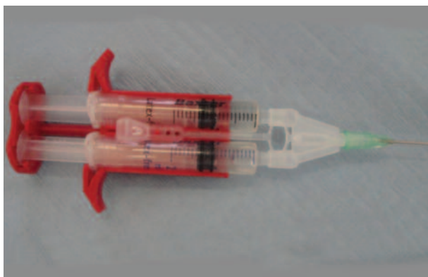
Figure 9: The Duploject : A syringe-holding system that will help to apply an equal proportion of biological glue to the extraction socket area.

Non-invasive extraction site healing involves osteoclastic and osteoblastic activity to remodel the tooth socket, and the action of bisphosphonate in the region with the bacterially infested saliva, results in alteration of the healing process. Therefore the use of biological glue in the present case positively influenced the prognosis. This observation could also be explained, not only by the biological action of the glue, but also by the different characteristics of the bone