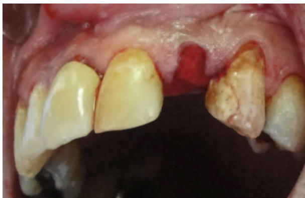
Figure 5: Hemostatic sponge placed in order to enhance the healing rate in this region.